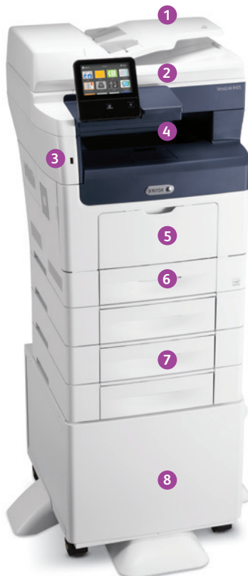
Xerox® VersaLink® B405 Multifunction Printer Print. Copy. Scan. Fax. Email.