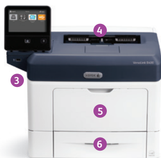
Xerox® VersaLink® B400 Printer Print.